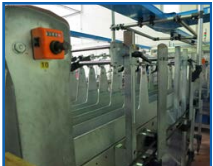
LOT 38 DIMAC AUTOMATIC SHRINK BUNDLER