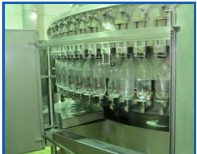
LOT 14 AVE FILLER CAPPER