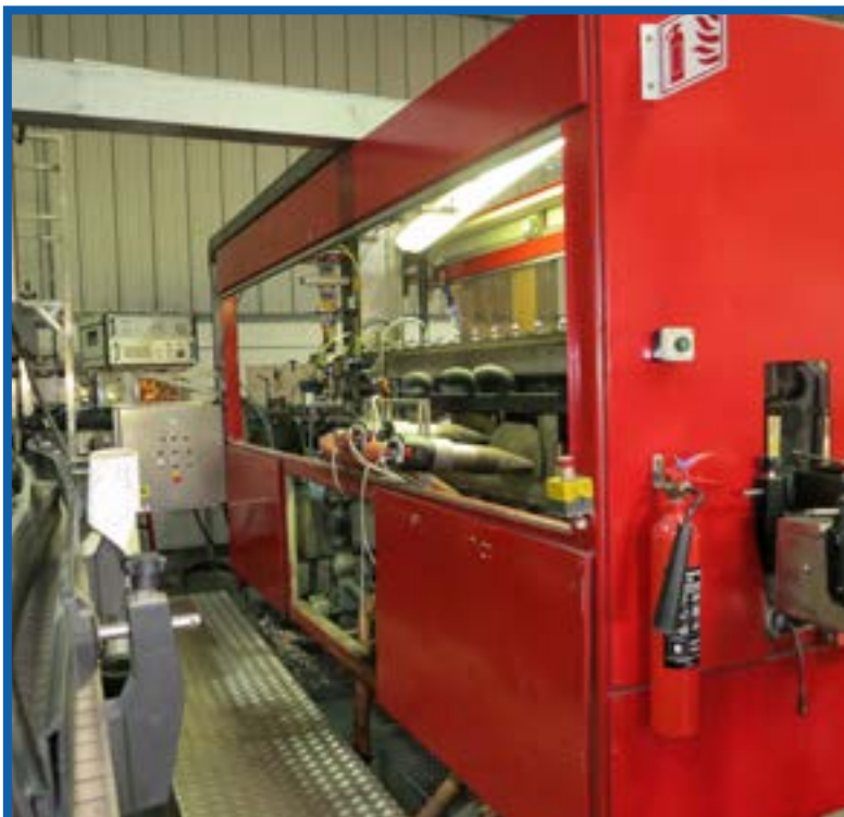
LOT 43 FUJI BOTTLE SLEEVING MACHINE