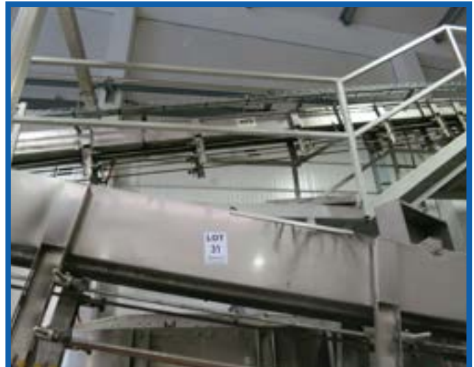
LOT 31 NTS AIRVEYOR STYLE TRANSFER CONVEYOR