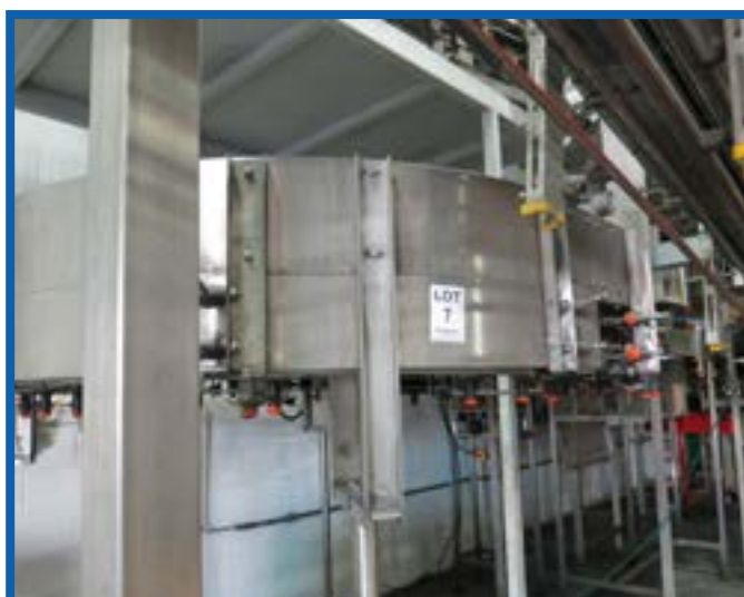
LOT 7 AIRVEYOR STYLE CONVEYOR