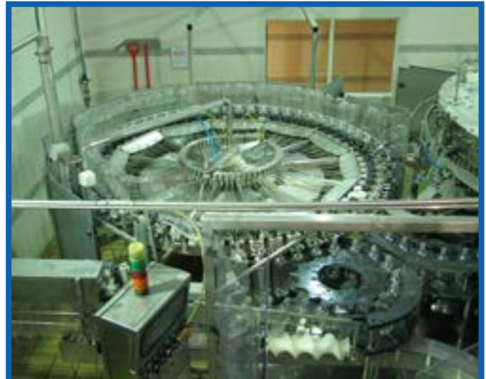
LOT 14 AVE FILLER CAPPER