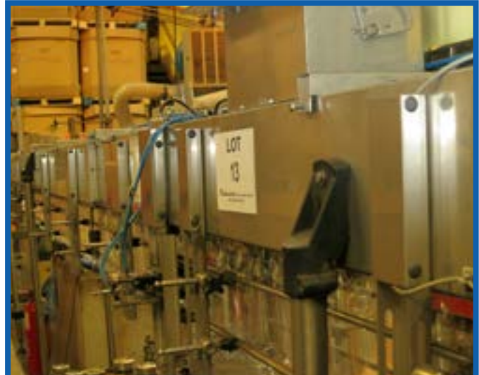
LOT 13 AIRVEYOR STYLE CONVEYOR