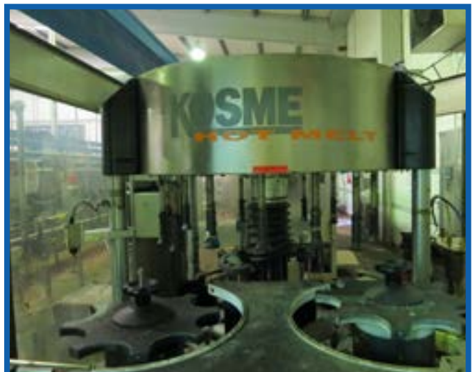
LOT 35 KOSME LABELLER