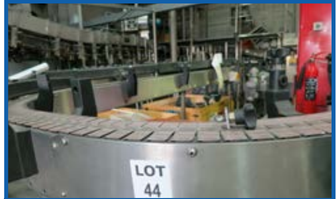
LOT 44 BOTTLE CONVEYOR