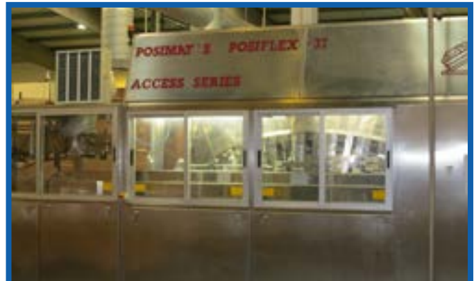
LOT 45 POSIMAT BOTTLE UNSCRAMBLING MACHINE