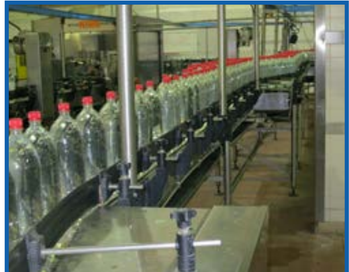
LOT 19 OGC BOTTLE CONVEYOR