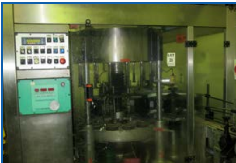
LOT 35 KOSME LABELLER