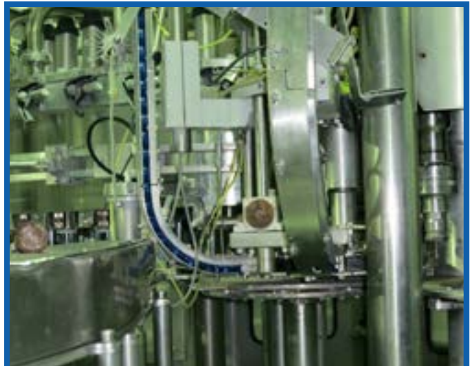
LOT 33 MUVITEC RINSER-FILLER, CAPPER