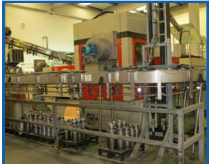
LOT 13 AIRVEYOR STYLE CONVEYOR