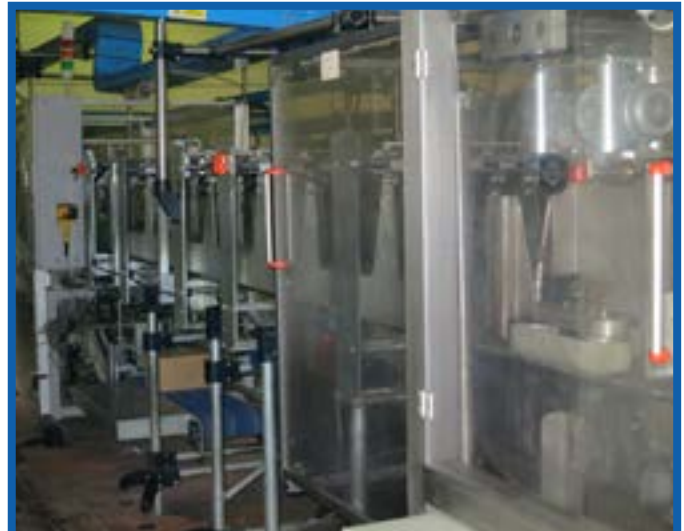
LOT 38 DIMAC AUTOMATIC SHRINK BUNDLER