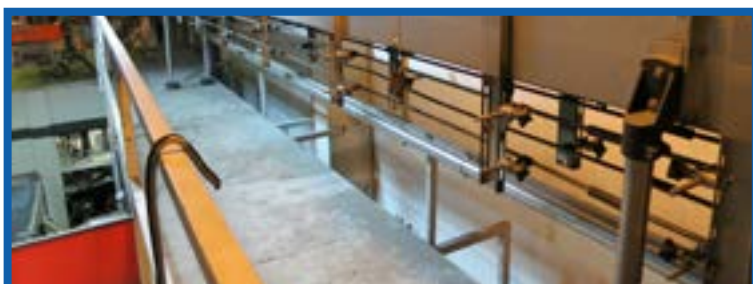
LOT 7 AIRVEYOR STYLE CONVEYOR