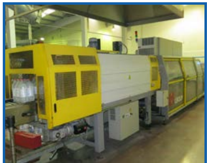
LOT 22 SMI AUTOMATIC SHRINK WRAPPER