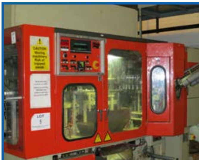
LOT 5 SIDEL STRETCH MOULDING MACHINE