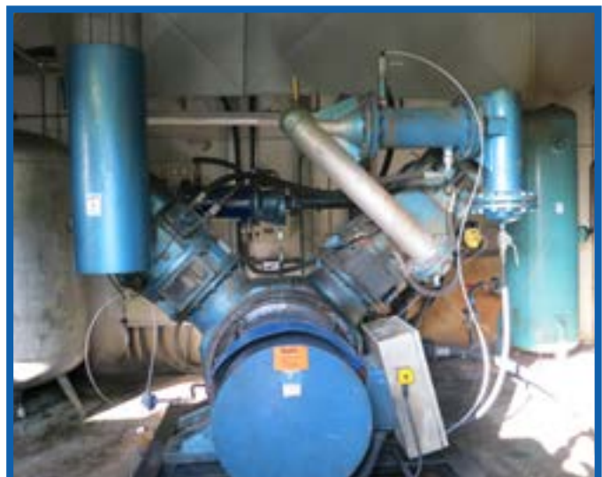
LOT 9 AIR COMPRESSOR