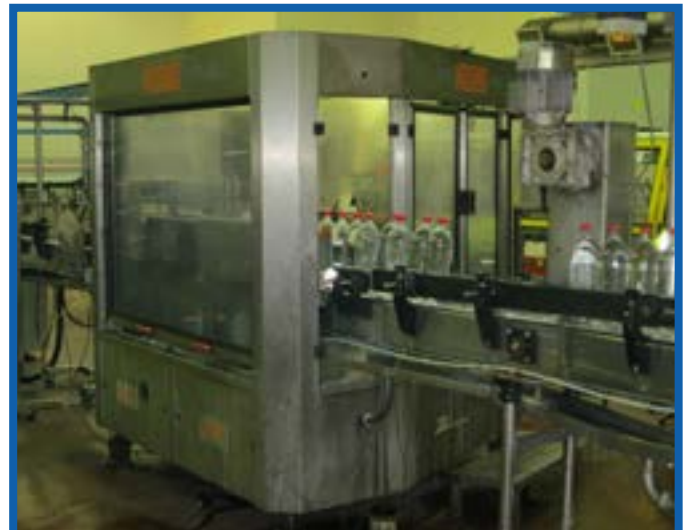
LOT 20 KOSME LABELLER