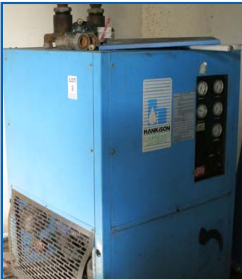
LOT 9 AIR COMPRESSOR