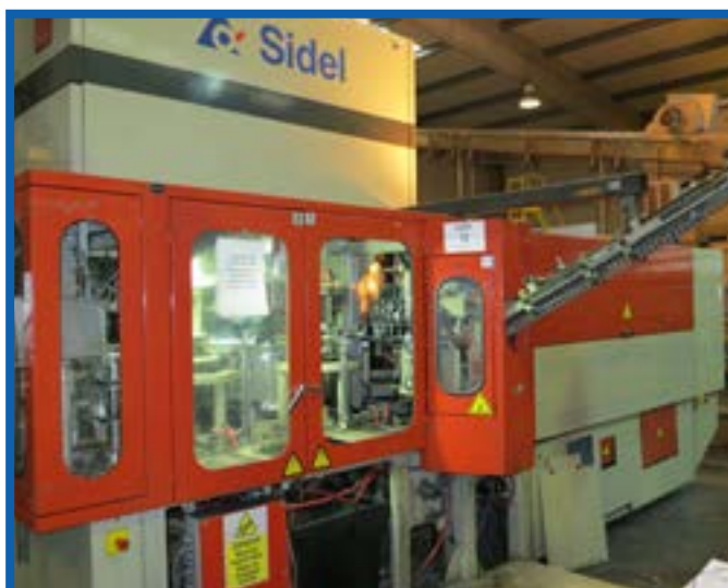
LOT 12 SIDEL STRETCH MOULDING MACHINE