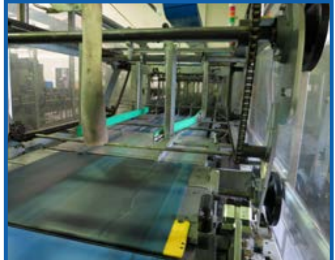
LOT 38 DIMAC AUTOMATIC SHRINK BUNDLER