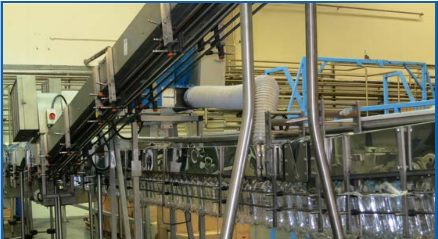
LOT 46 AIRVEYOR STYLE CONVEYOR