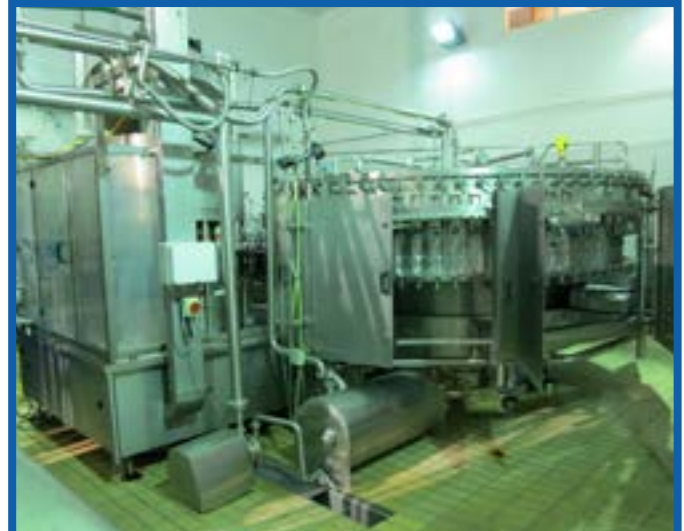
LOT 14 AVE FILLER CAPPER