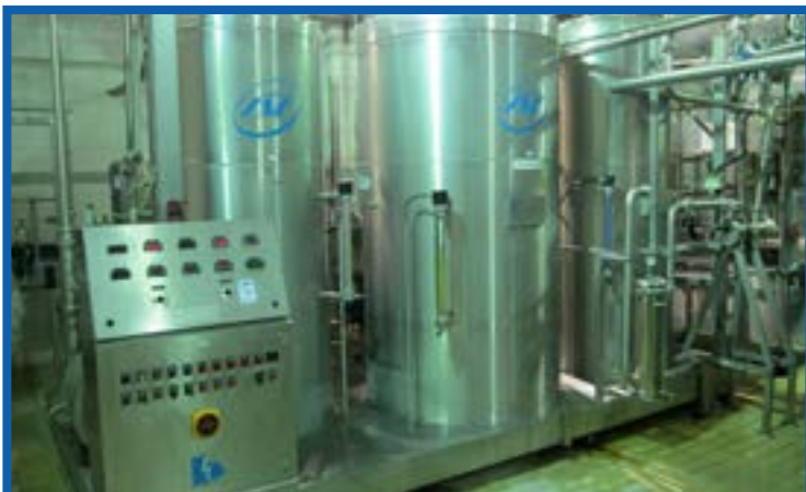
LOT 16 AVE MIXER CARBONATOR