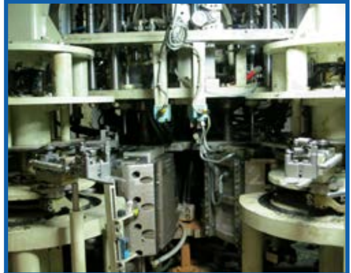
LOT 29 SIDEL BLOW-STRETCH MOULDING MACHINE