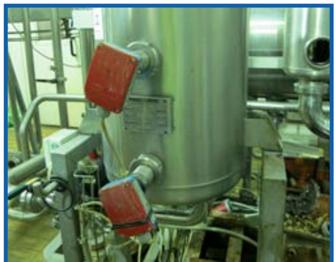
LOT 32 BELLISS & MORCOM AIR COMPRESSOR

For full details and further photographs visit: EquipNet.com/glenpatrick